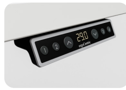
Pre-settable Memory Positions