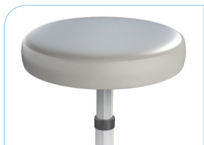
IC+ Seat Style

The Ultimate Medical Stool Black Package with IC+ Seat Style and Optional IC+ Seat-Back