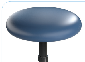
Upholstered / Vinyl Seat Style